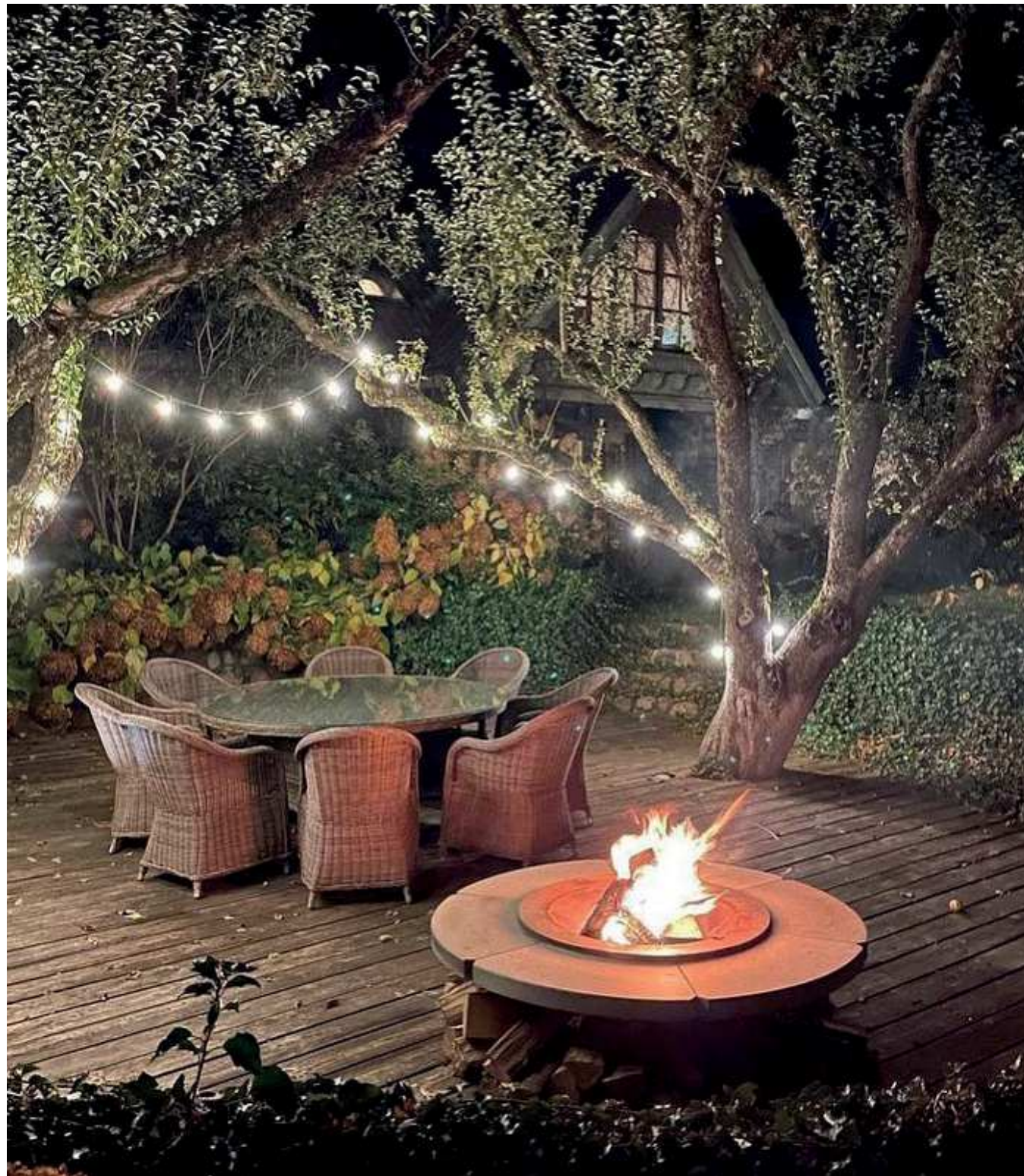
STONE WOOD ROUND SQUARE