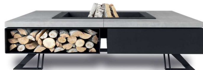
ALU - INOX