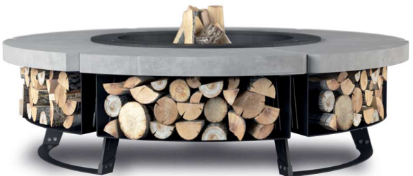
ALU - INOX