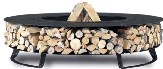
ALU - INOX